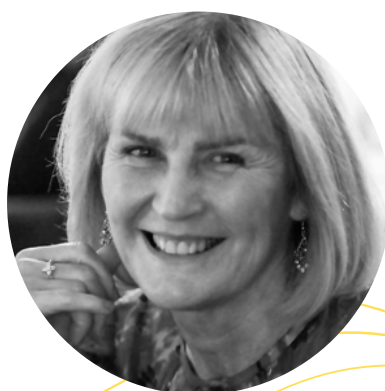
Christine Bond Gardens